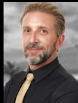
MIC BRAND 082 940 0167 mic@dgproperties.co.za